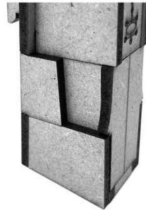
Glue the additional lower detail plates on both sides as shown