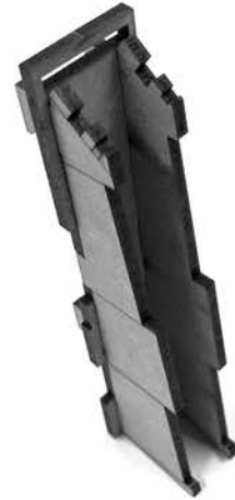
Glue side plates in as shown