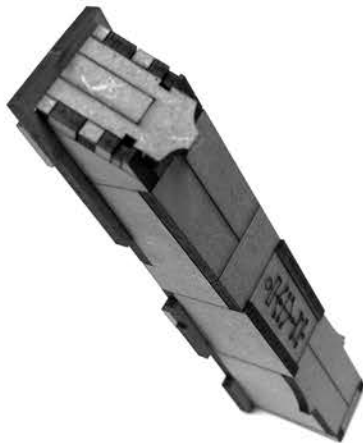
Glue the front a top plates on as shown