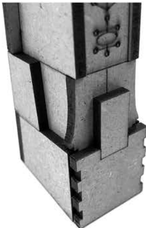
Glue the front detail plate on as shown