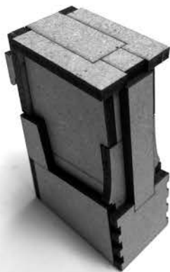
Glue the front detail plate on as shown