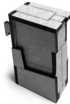
Glue the additional lower detail plates on both sides as shown