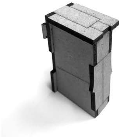
Glue the front and top plates on as shown